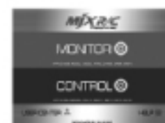
CLICK CONTROL BUTTON