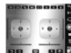
APP CONTROL IS SHOWN ON THE SCREEN