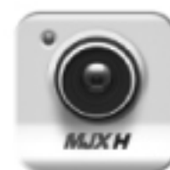
OPEN "MJX H"