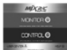
CLICK MONITOR BUTTON