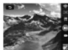
IMAGE IS SHOWING ON THE SCREEN