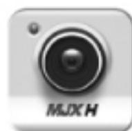
OPEN "MJX H"